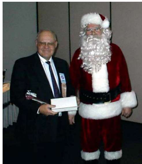
Our President finds out if he has been naughty or nice...